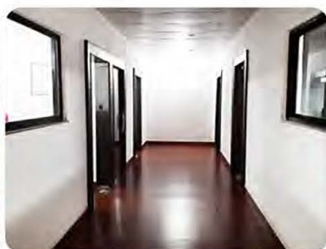
QA & QC